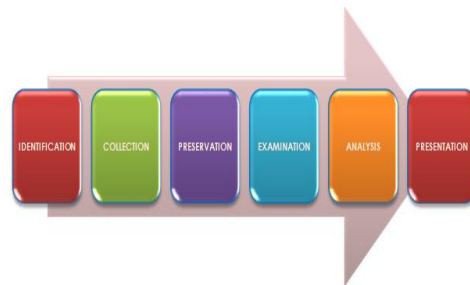
Figure 2: Process in Digital Forensics

Identification refers to what type of data can be retrieved using various computer tools and software suites. The next step is to collect all the available data sources that are imperative to the retrieval process. The data extracted through tools is preserved for further process. The Examination process analyses the data retrieved with detail introspections. The Studied data is exactly interpreted with relevant supporting documents. Finally the presentation is done through retrieved data. The presentation normally helps in trials and to solve cases pertaining to the crime. Figure 2 describes the basic process in digital forensics.